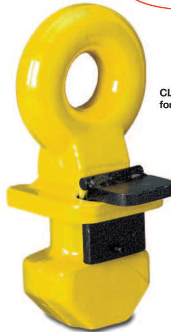
CLT for top lifting