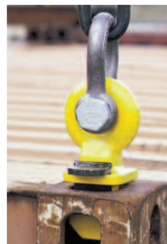
Container lifting lug CLT