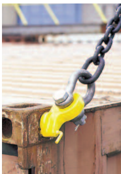
Container lifting lug CLB