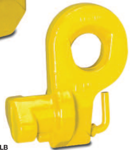
CLB for side lifting